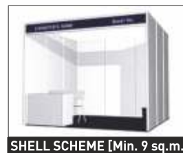
SHELL SCHEME [Min. 9 sq.m.]